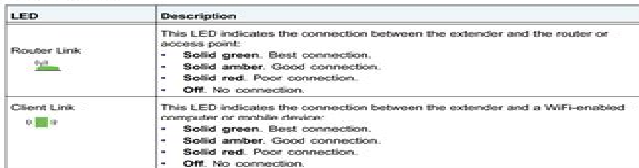
Table 1. LEDs