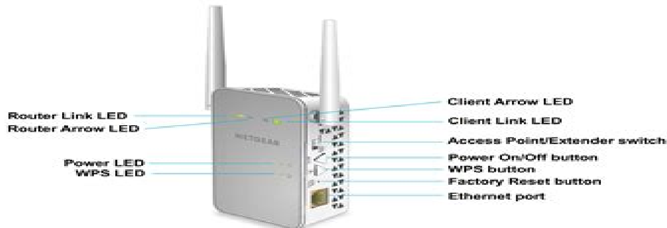
Figure 1. Front and side panels

The LEDs are located on the front panel. A switch, buttons, and an Ethernet port are located on the side panel.