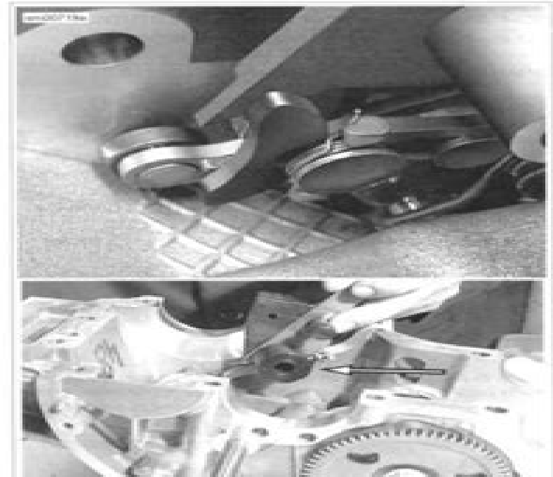
Figure 6-37. Shift Mechanism/Retractor (HD-45339)