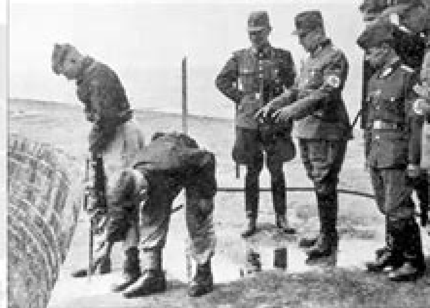
German soldiers inspect defences in France